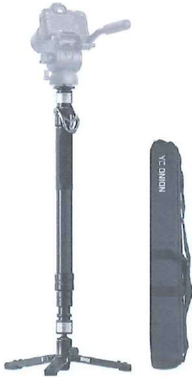
Portable Tripod for DSLR with travel bag