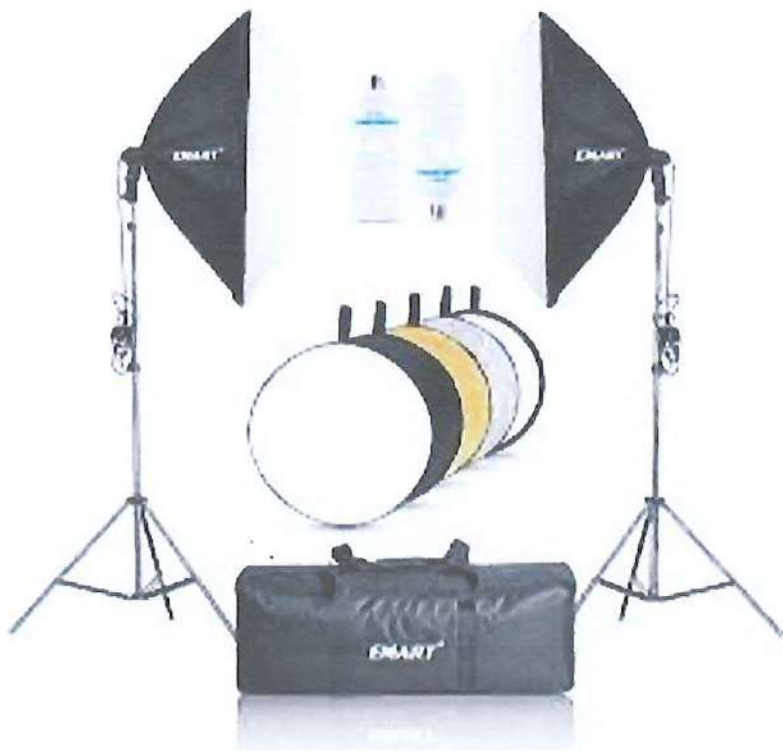
Set Softbox Lighting Studio Light Kit