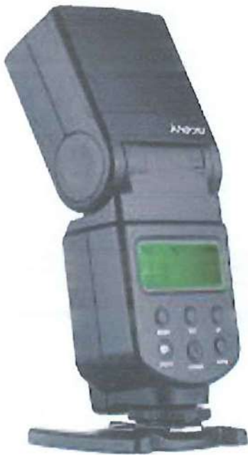
Universal Flash Speed lite GN40 Adjustable LED Fill Light On-camera Flash With Bracket Replacement for Canon Nikon Olympus Pentax DSLR Camera