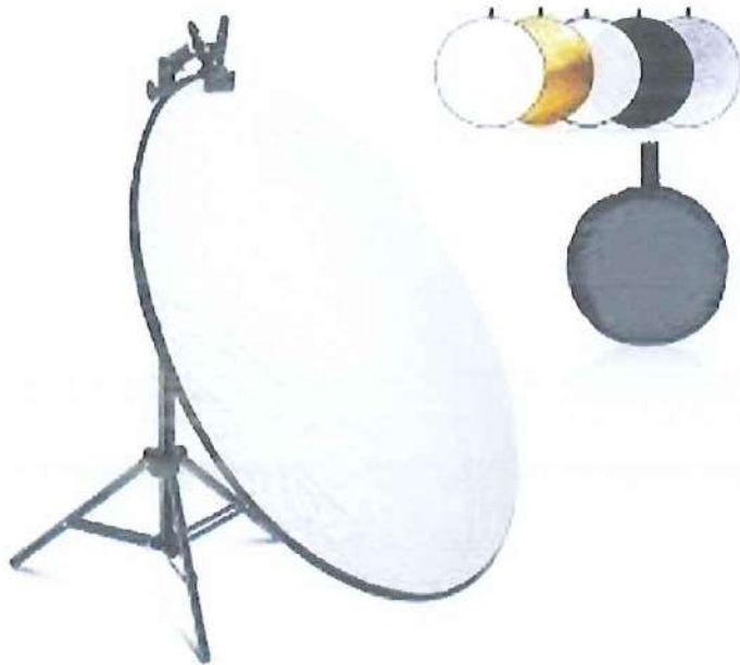
5 in 1 60cm Round Reflector