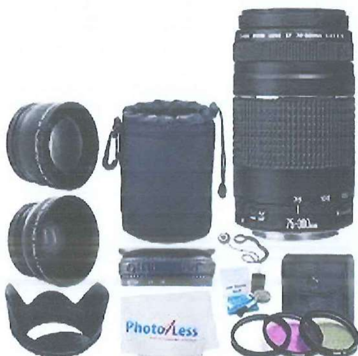
75-300mm F/4-5.6 Iii Lens + Wide Angle Lens & 2x Telephoto Lens + 3 Piece Filter Kit + Lens Pouch + Tulip Lens Hood + Lens Band + 5 Piece Cleaning Kit + Cleaning Cloth