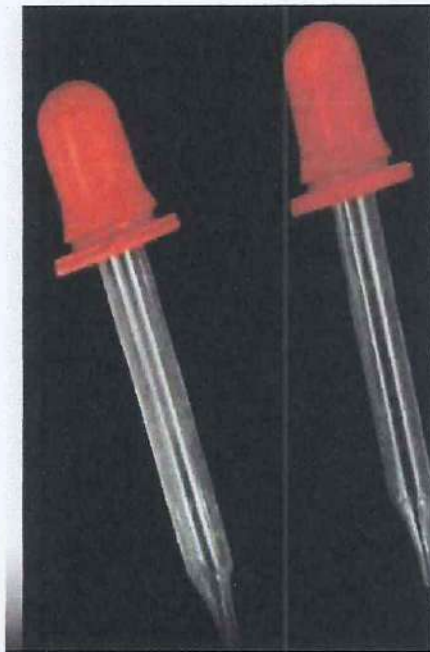
Narrow edge medicine dropper