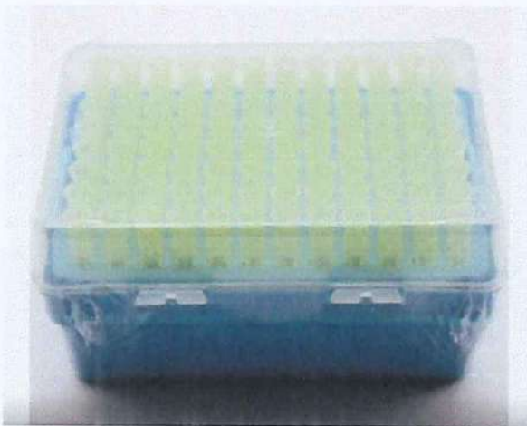
200ul Pipette tip box