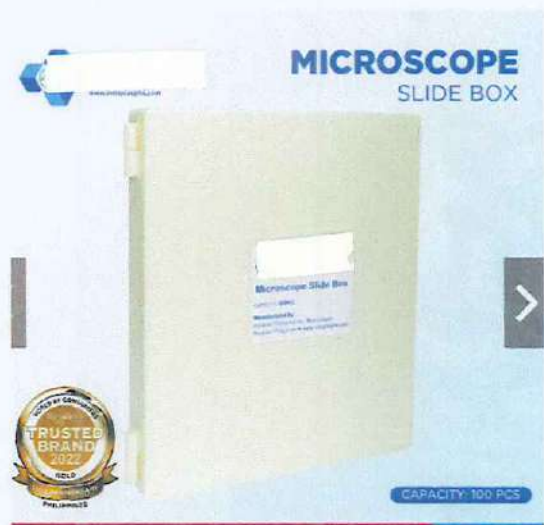
100's Plastic Microscope Slide box