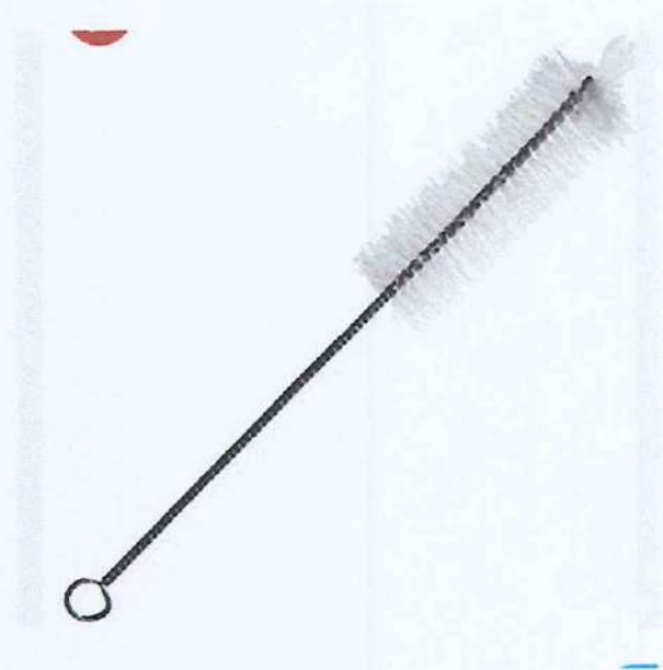
Test tube brush (S,M,L)